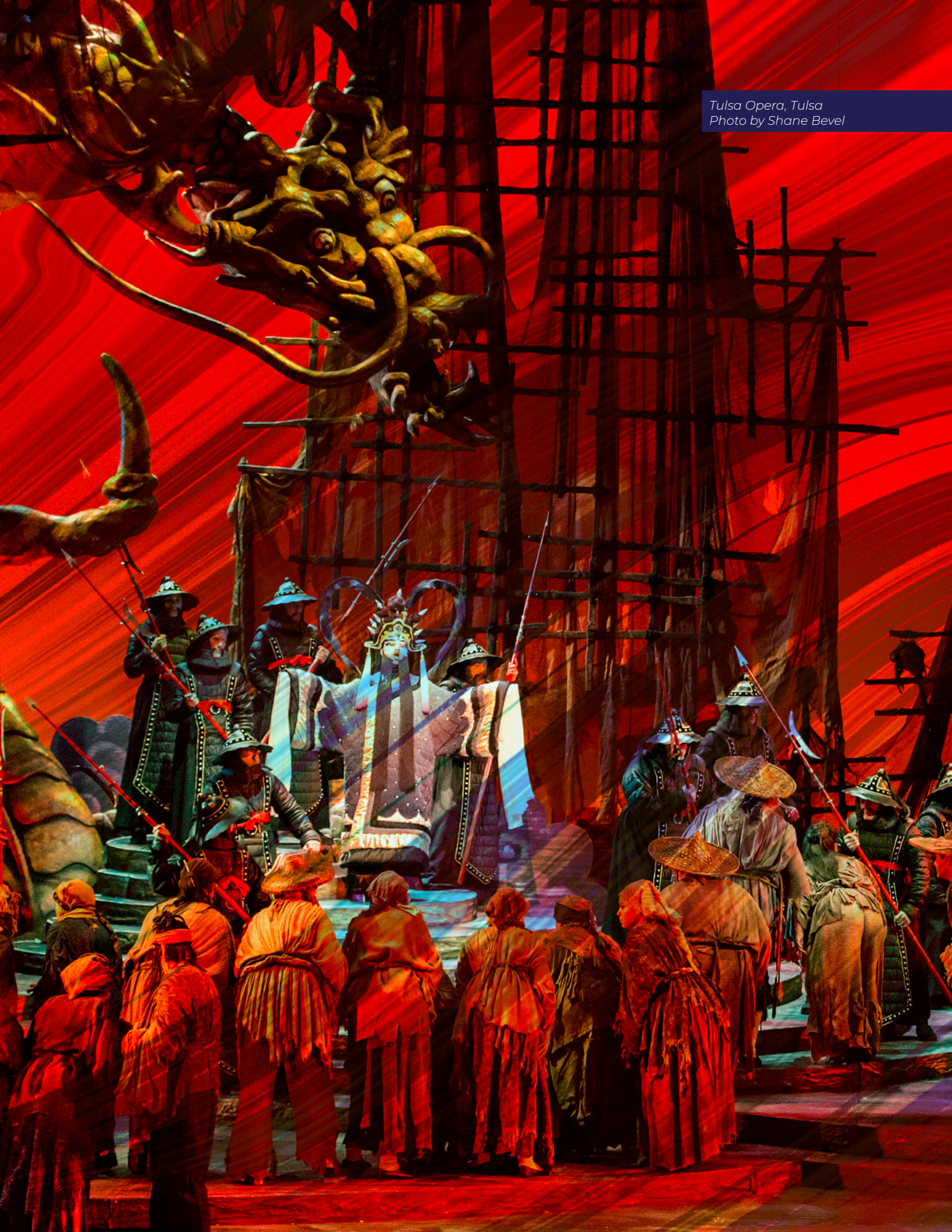
Tulsa Opera, Tulsa