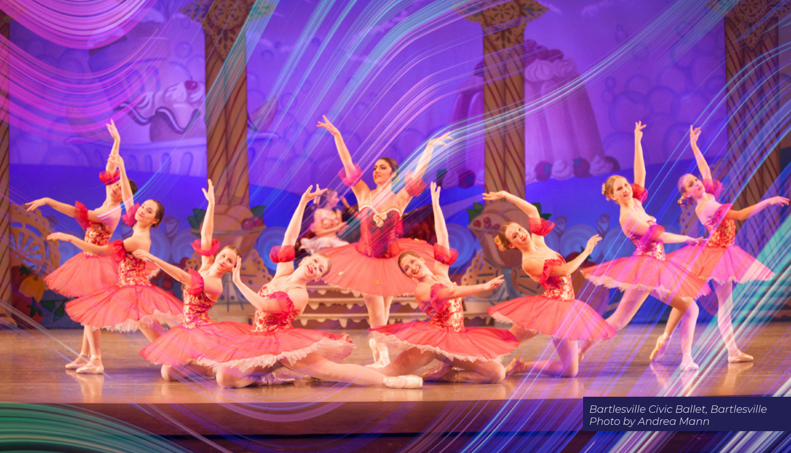
Bartlesville Civic Ballet, Bartlesville