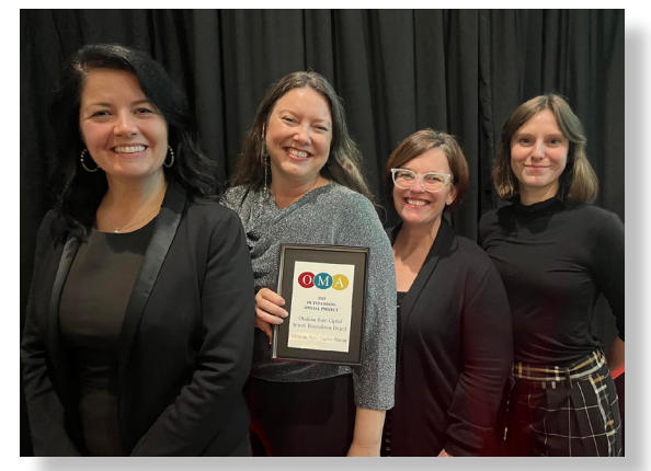
Our planning and work to thoughtfully reinstall the artwork at the Capitol—years in the making—was recognized with an Outstanding Special Project award from the Oklahoma Museums Association.

The Oklahoma Arts Council celebrated Indigenous Peoples' Day at the Capitol in FY24. The gathering commemorated new Capitol artworks and featured remarks by premier Native artists who created them.